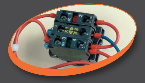
Crimped cable conduit sleeves for optimal contact The crimped sleeves limit risk of fire or electrocution during maintenance.